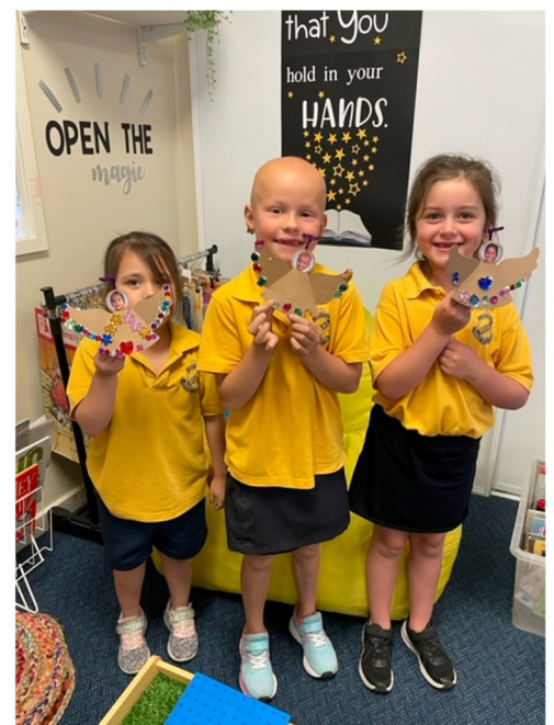
Christmas craft was made by the Infants classes this week!

We run art classes, daily cooking experiences, sports, conservation programs within the school, and excursions to explore around your local community!