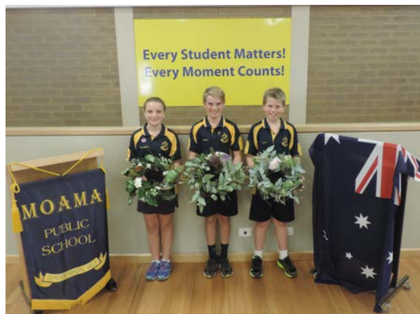
MPS ANZAC Service